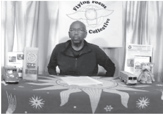
PC Peri hosts from a living room, not a studio, for the "Thirty-Second Busiversary" (VB #129.7&8)