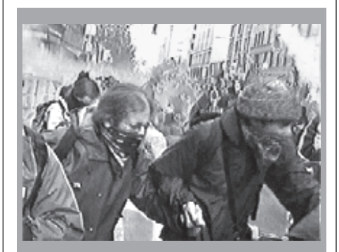
Economic justice activists escape police pepper spray in Protest In Seattle: Resisting the WTO (VB #34.4)

Protest in Seattle: Resisting the WTO Labor, environmental, and human rights activists shut down the World Trade Organization. ¥ VB #34.4 $11